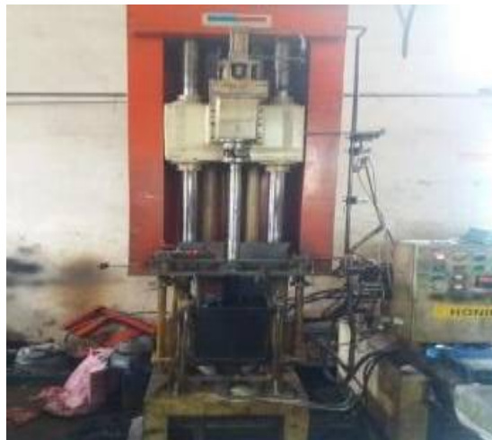
Fig 7: working

Honing is a low velocity abrading process in which stock is removed from metallic or non-metallic surfaces by bonded abrasive sticks. It is a finishing operation employed not only to produce high finish but also to correct out-of-roundness, taper and axial distortion in work piece. In honing, since a simultaneous rotating and reciprocating motion is given to the stick, the surface produced will have a characteristic cross-hatch lay pattern. In this project we have replaced the fine abrasive partical with the bigger partical and by reducing the spindle pressure the stick mark on the tube get reduced