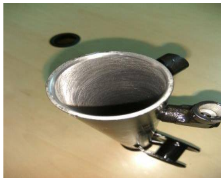
Fig.5: finished component

reciprocating in linear motion and rotates in one direction to machining the hydraulic cylinder. The grain size of the diamond tip will be smaller to increase the accuracy of the dimension in hydraulic cylinder.