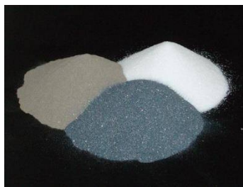
Fig 4: Abrasives

3. Diamond is used for honing extremely hard and wear resistant materials such as tungsten, carbide or ceramics.