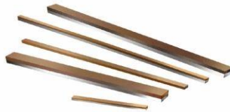
Fig 4: Honing stone

Honing stones sometimes known as honing stick. A honing stone is similar to a grinding wheel in many ways, but honing stones are usually more friable so that they conform to the shape of the work piece as they wear in. To counteract their friability, honing stones may be treated with wax, or sulfur to improve life; wax is usually preferred for environmental reasons