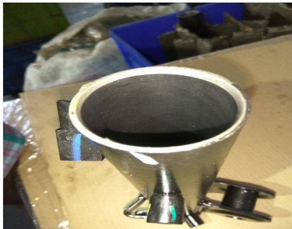
Fig 6: Finished component Implemented operating stick specification: Length = 100mm

The implementation of tool have the same specification but the difference is increasing the grain size of the abrasive particles. It helps in more metal removal rate with low pressure. If the pressure of the tool is decreased the stick mark is reduced.