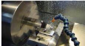
Fig 3: Cutting Fluid