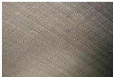
Fig 2 cross batch

A “cross hatch” pattern is used to retain oil or grease to ensure proper lubrication and ring seal of pistons in cylinders. A smooth glazed cylinder wall can cause piston ring and cylinder scuffing. The “cross hatch” pattern is used on brake rotors, and flywheels. Abrasive grains are bonded in the Form of sticks by a vitreous or resin material and sticks are presented to the work. For cylindrical surfaces the abrasive grains are given a combination of two motion-rotation and reciprocation. The resultant motion of the grains is a Crosshatch lay pattern with included angle between 20 and 60.