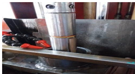
Fig 1 Honing process

Here the work piece does not perform any working motion. An abrasive stone against it along a controlled path. Honing is primarily used to improve the geometric form of a surface, but may also improve the surface texture. It is a final finishing operation employed not only to produce high finish but also to correct out-of-roundness, taper and axial distortion in work piece. In honing, since a simultaneous rotating and reciprocating motion is given to the stick, the surface produced will have a characteristic cross-hatch lay pattern. In honing the small abrasive particles are mounted on tool according to the type of application the grid size can be varied. Honing is similar to lapping process in both work piece does not perform any working motion. The metal removal rate is depending upon the pressure applied on the work piece. Honing is used in many applications like automobile parts such as cylinders walls etc.,